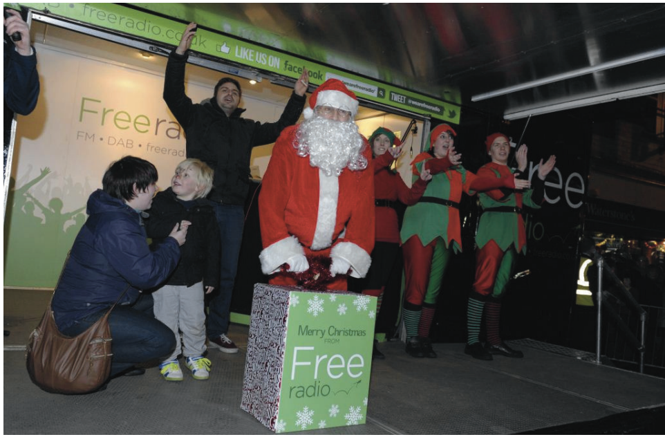
Father Christmas will be back to switch on the lights this year.

Sutton Coldfield is in for a treat this Christmas, with The Gracechurch Centre announcing its plans for the annual light switch on.