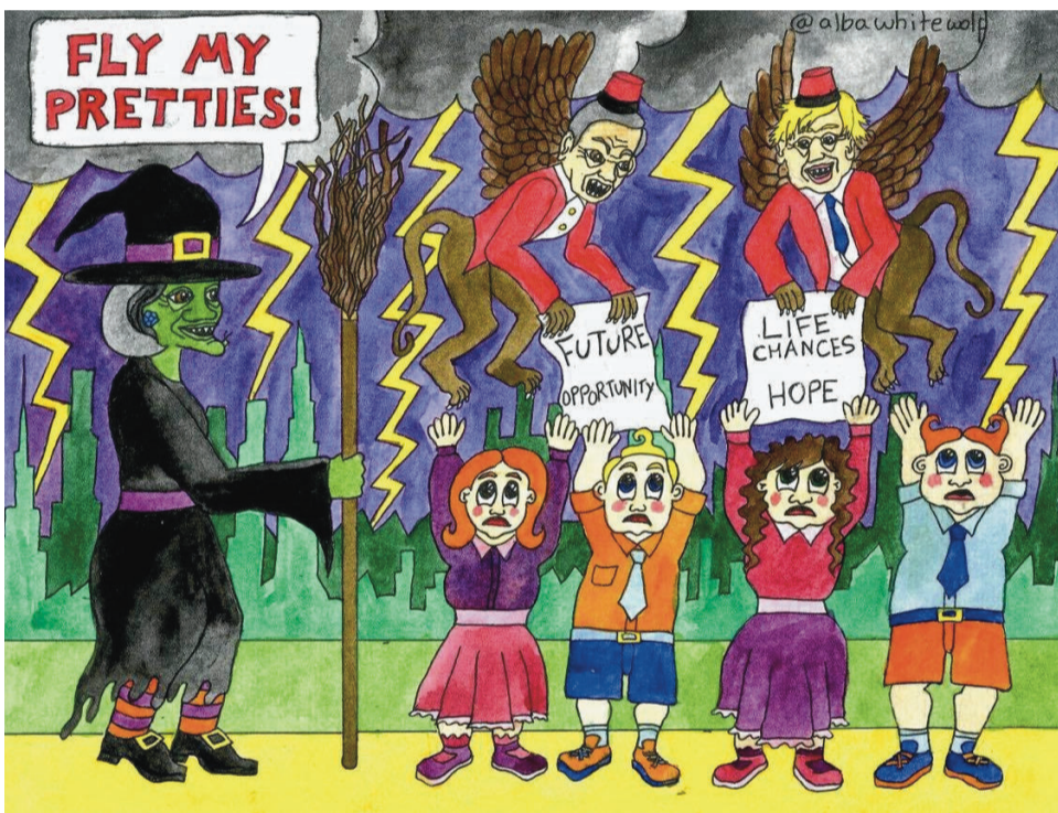
Illustration by Madeleine Kay