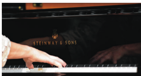
A Steinway School of Excellence

The City of Edinburgh Music School is unique. It is the only specialist Music School that covers the whole age range from 4 to 19 and is totally funded by the Scottish Government so it does not charge any fees. Entry is by audition and the gifted children selected receive specialist tuition in all aspects of music while based full-time at newly built state-of-the-art facilities in Flora Stevenson Primary and Broughton High Schools in Edinburgh.