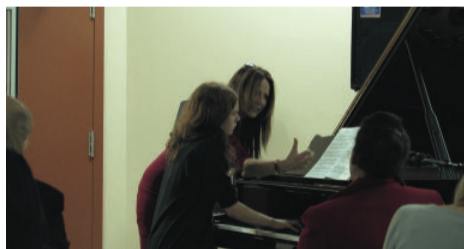
Piano masterclass with Joanna MacGregor

Students from the school were recently invited to perform at the 2012 Olympic Celebrations in London, accompany the National Youth Orchestra of Iraq's first British tour with Julian Lloyd Webber, take part in both the International and Fringe Festival and, have been featured on national radio and television programmes.