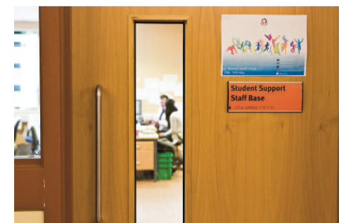
Pupil Support teams help students realise their potential