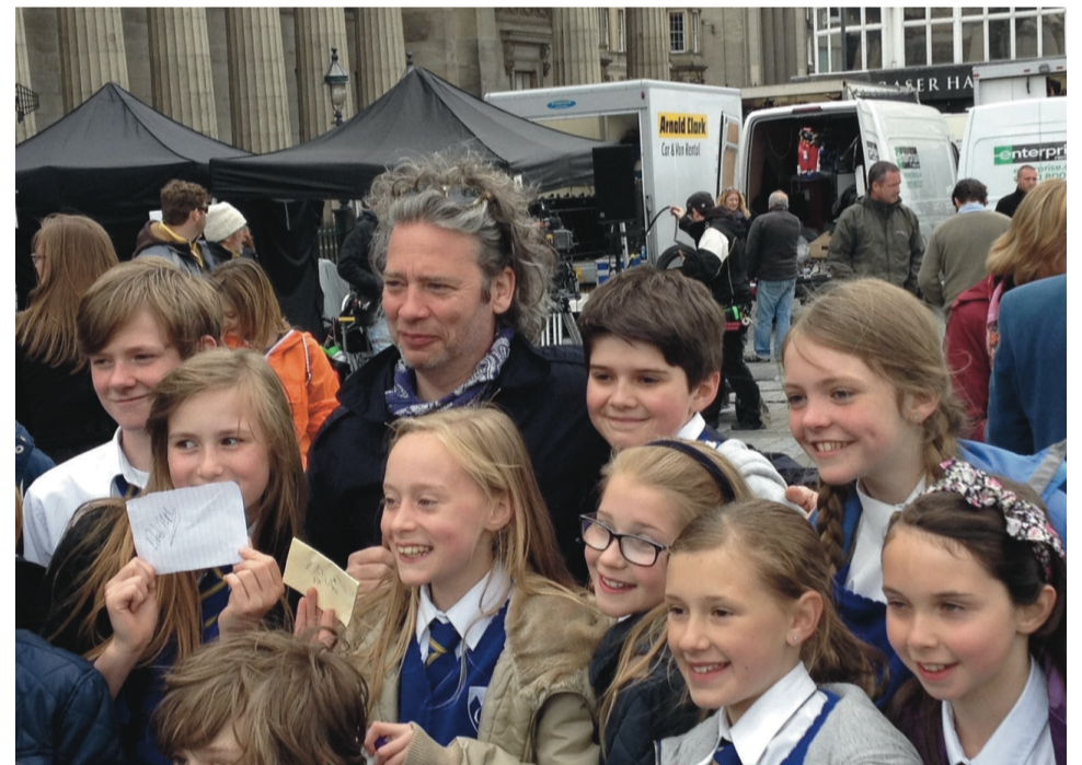
Pupils on set of Sunshine On Leith with Director Dexter Fletcher

All dance school students were very successful in their recent Royal Academy of