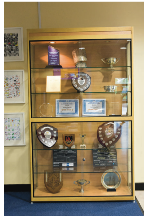
Our trophy cabinet is very full this year

We were down 1-0 at half time and the Broughton supporters feared the worst.