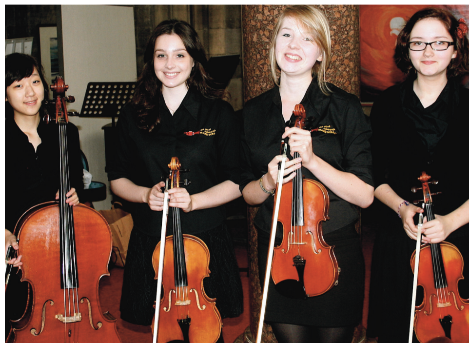
A quartet at the Fringe