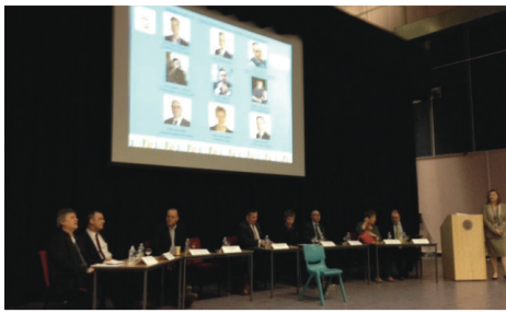
Question Time for pupils