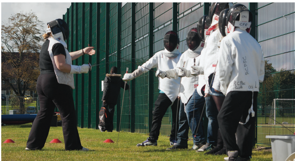
Broughton offers new experiences

We are very proud of our young citizens.