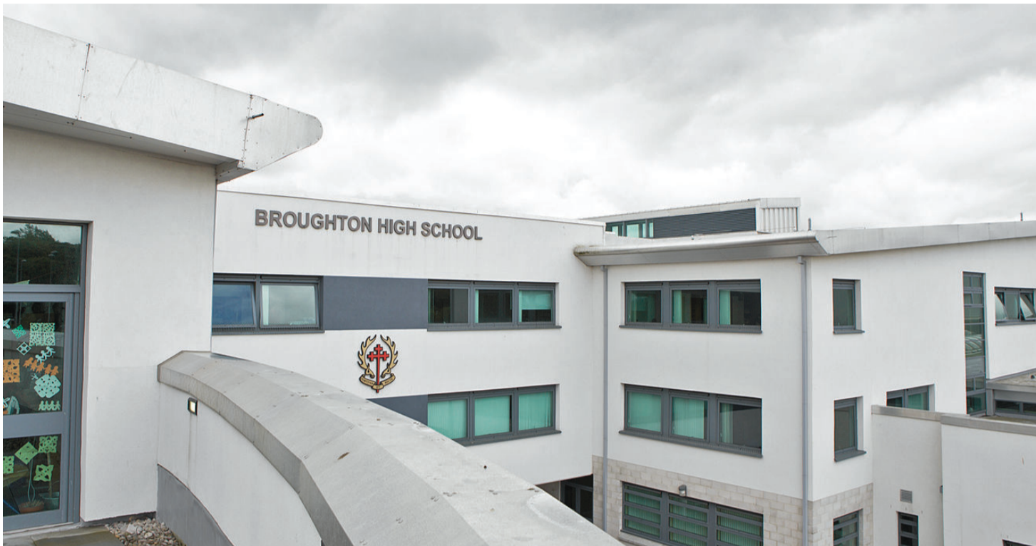
Broughton High School campus, also home to City of Edinburgh Dance School, City of Edinburgh Music School, SFA Football Academy