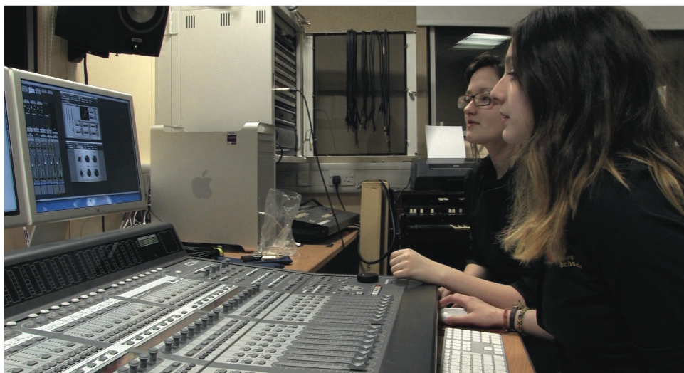
State-of-the-art studio facilities

Sir Simon Rattle, CBE is the patron of the Music School. Financial assistance is given for travel if students live further afield, and there is also a trust fund to provide scholarships and resources for specialist music students.