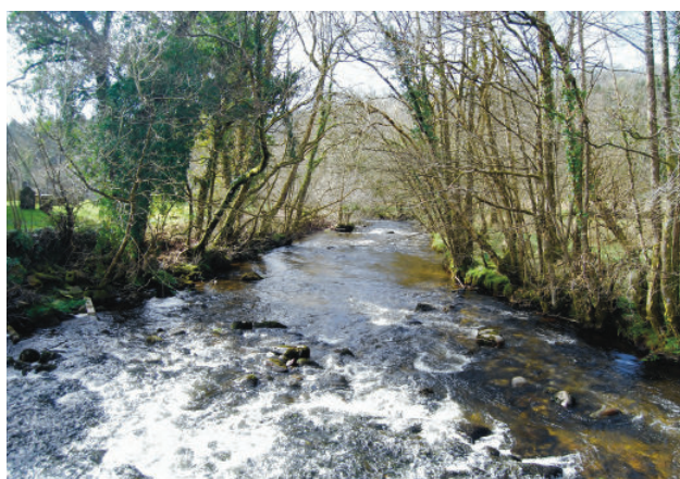
The Cleddau.