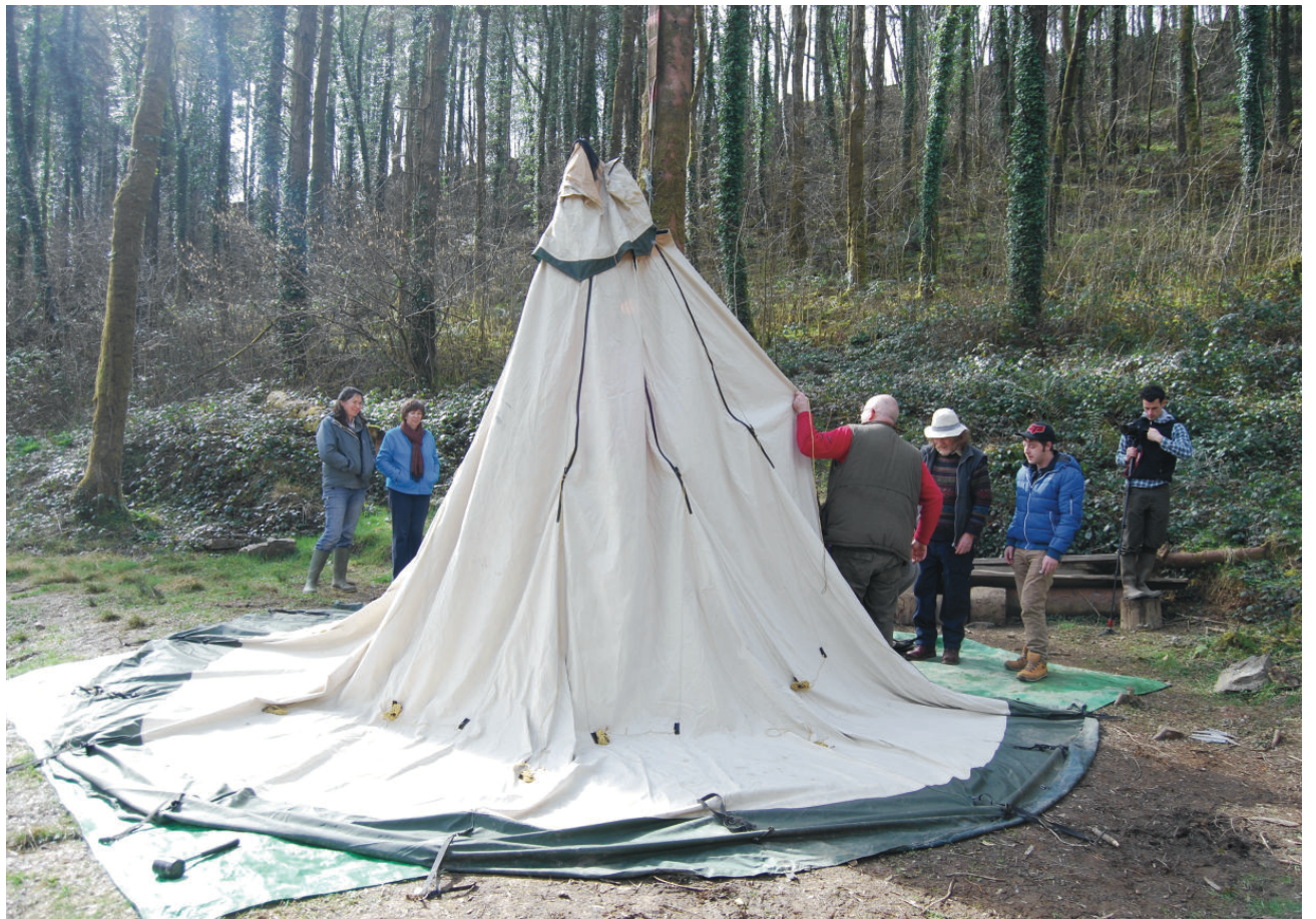
Photograph by Alan