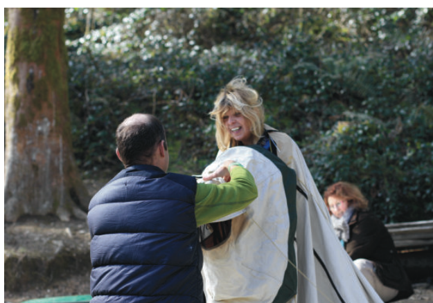
Wearing the tent.