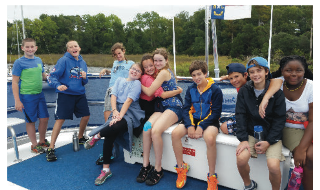
The 6th Grade at Camp Seafarer