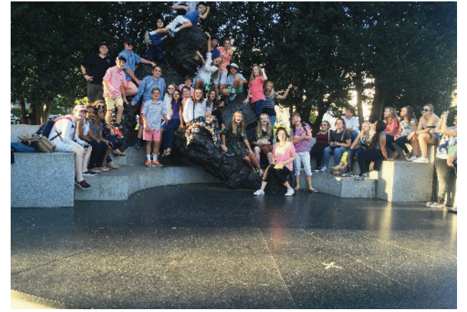
The 8th Grade in Washington D.C.

Well we tried to catch up with 6th Grade but they are a little shy. We assume they are still getting used to the Middle School, but that's OK! The one comment they did make on their class trips was that it was fun and it rained a lot.