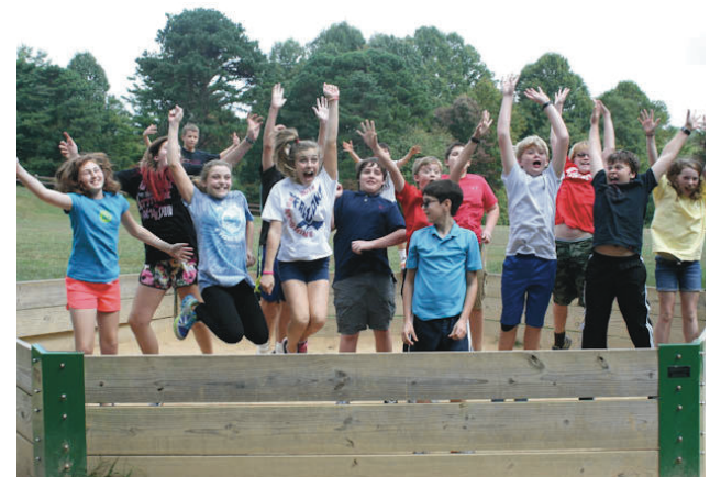
The 7th Grade at High Rocks