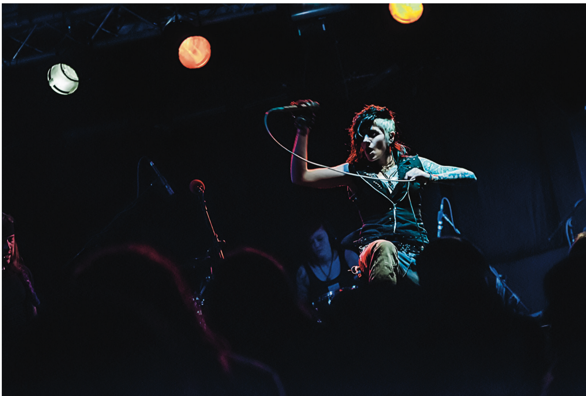
Chasing Dragons: Corporation, Sheffield