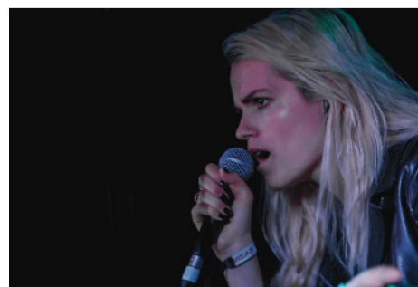
Say Lou Lou