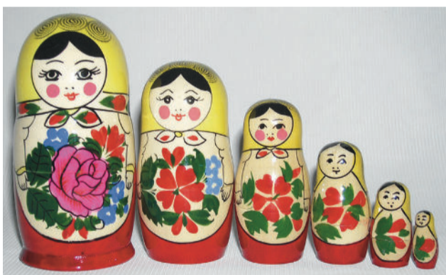
Nesting Dolls, Russia, 1890