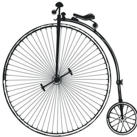
Penny-Farthing Bicycle, USA, 1878

Students will gain both knowledge and personal understandings of what the generations that came before them considered fun as children.